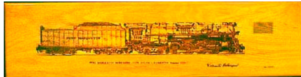
Pere Marquette Railroad Class N-1, 2-8-4, on White Oak