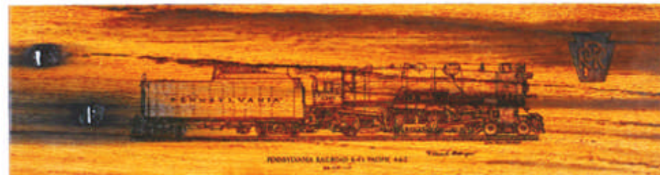
Pennsylvania Railroad Class K-4, on Re-sawn RR Tie (red oak)